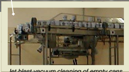
Jet blast vacuum cleaning of empty cans